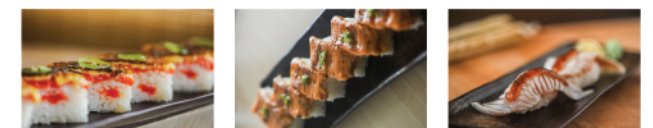
Wild Salmon Oshi Ebi Oshi Tuna Toro Aburi