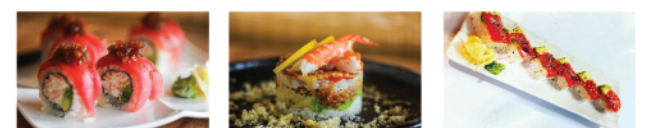
Red Seal Roll Mauna's Aburi Tart Hoki Poke Box