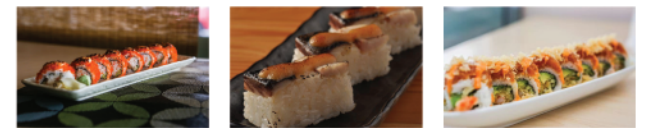
Explosion Roll Saba Oshi Hawaiian Roll